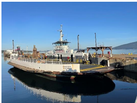
M/V Guemes docked at our contractor's facility in Anacortes.