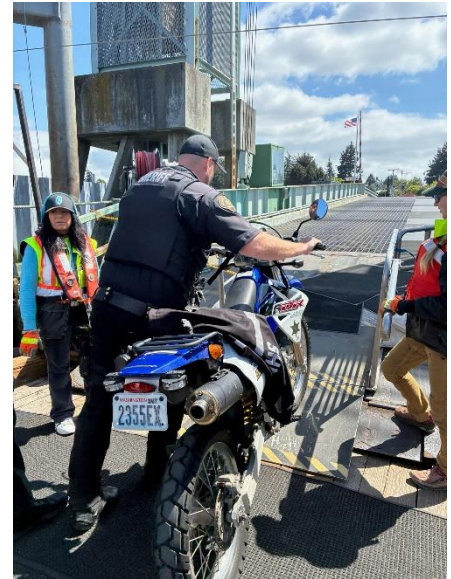
Sheriff's Office brought over our small motorcycle this week to help operations on the Island.

As a reminder, peak season starts on May 20. Nonpeak tickets cannot be used from May 20 through September 30. Peak season tickets are now available to purchase, along with nonpeak tickets, on our website, mobile app, and the Anacortes terminal ticket kiosk.