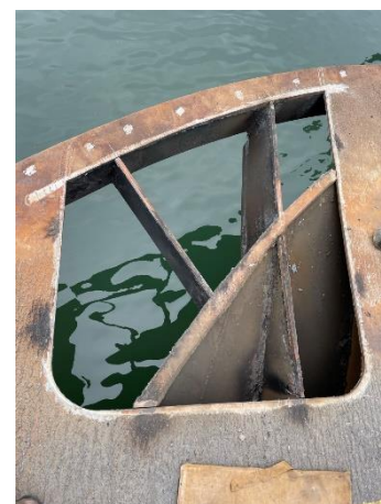
Steel removal from the car deck.