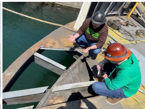
Contractors removing the car deck steel.